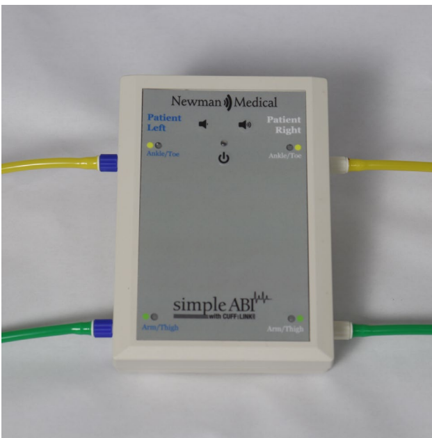
Cuff-Link Control Unit with tubing properly attached