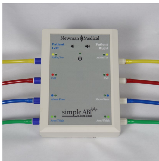
Cuff-Link Control Unit with tubing properly attached