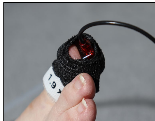
PPG & cuff on Toe