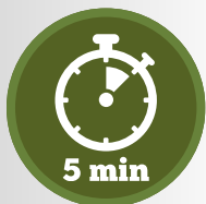
ABI-Q Rapid Screen