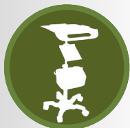
simpleABI Roll Stand