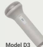
Model D3 3MHz Fetal Probe