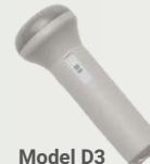
Model D3 3MHz Fetal Probe