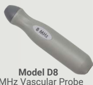
Model D8 8MHz Vascular Probe