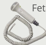
Model D2W 2MHz Waterproof Fetal Probe