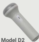
Model D2 2MHz Fetal Probe