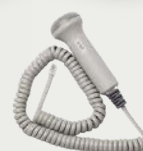
Model D3W 3MHz Waterproof Fetal Probe

Interchangeable probes can be used on any DigiDop