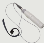
Model DPPG Audio TBI PPG Probe