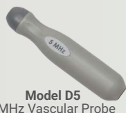
Model D5 5MHz Vascular Probe