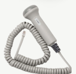
Model D3W 3MHz Waterproof Fetal Probe

Interchangeable probes can be used on any DigiDop