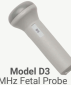
Model D3 3MHz Fetal Probe