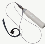
Model DPPG Audio TBI PPG Probe