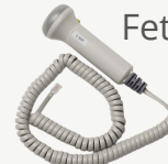
Model D2W 2MHz Waterproof Fetal Probe