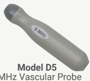
Model D5 5MHz Vascular Probe