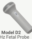
Model D2 2MHz Fetal Probe