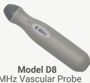
Model D8 8MHz Vascular Probe