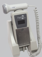
Recharging Wall/Table Base (ACC-131)