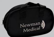
Carry Bag (ACC-170)