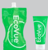
Ultrasound Gel 8.8oz | 2.1oz (GEL-110) (GEL-100)