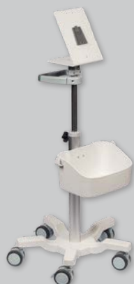
Roll Stand (STND-121)