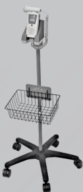
Roll Stand (STND-121)