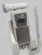
Wall/Table Base (ACC-121)