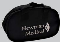
Carry Bag (ACC-170)