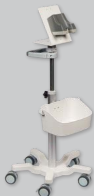
Roll Stand (STND-131)