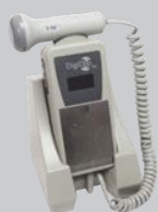
Recharging Wall/Table Base (ACC-131)