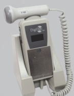
Wall/Table Base (ACC-121)