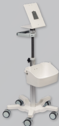
Roll Stand (STND-121)