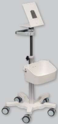
Roll Stand (STND-150)