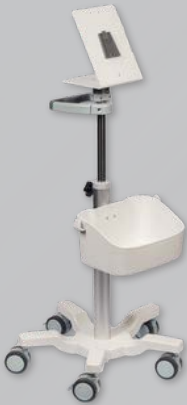
Roll Stand (STND-150)