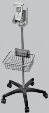
Roll Stand (STND-111)