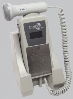
Recharging Wall/Table Base (ACC-111)