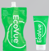
Ultrasound Gel 8.8oz | 2.1oz (GEL-110) (GEL-100)