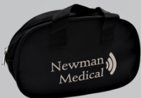
Carry Bag (ACC-170)