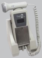
Recharging Wall/Table Base (ACC-111)