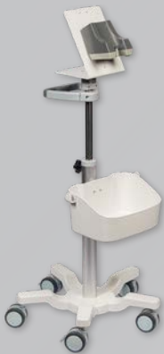
Roll Stand (STND-111)