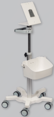
Roll Stand (STND-101)