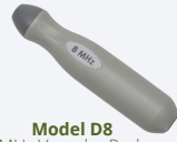
Model D8 8MHz Vascular Probe