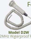
Model D2W 2MHz Waterproof Fetal Probe