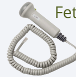
Model D2W 2MHz Waterproof Fetal Probe