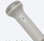
Model D3 3MHz Fetal Probe