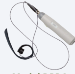
Model DPPG Audio TBI PPG Probe