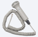
Model D3W 3MHz Waterproof Fetal Probe