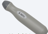
Model D8 8MHz Vascular Probe