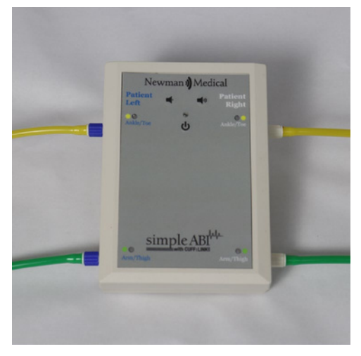
Cuff-Link-4 Control Unit with tubing properly attached

Leave cuffs on for treadmill protocol, but disconnect tubing.