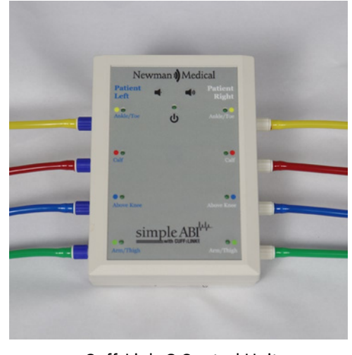
Cuff-Link-8 Control Unit with tubing properly attached