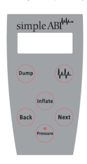
Cuff-Link Control Unit with tubing properly attached