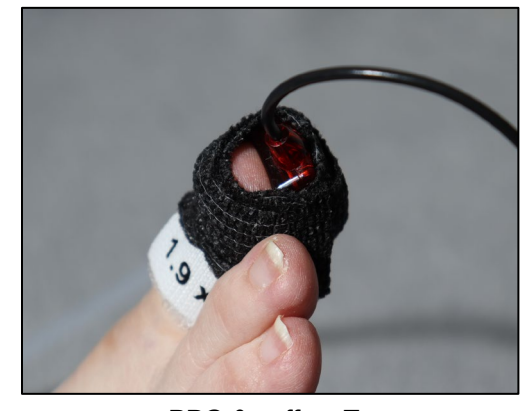
PPG & cuff on Toe