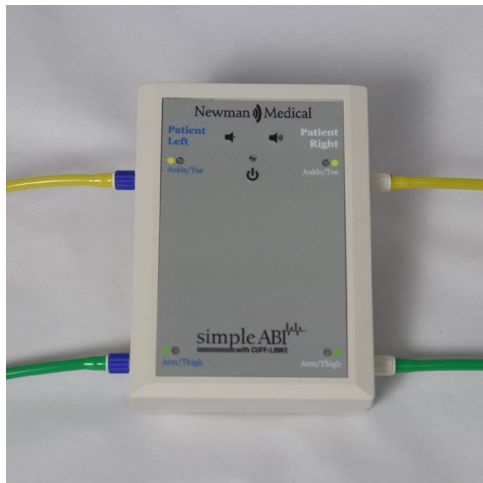
Cuff-Link-4 Control Unit with tubing properly attached