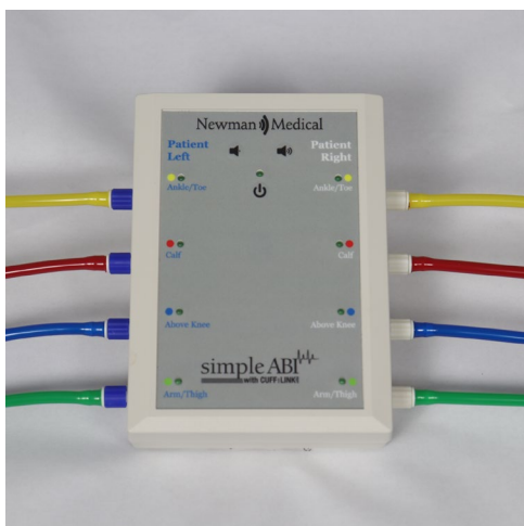
Cuff-Link-8 Control Unit with tubing properly attached